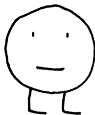
Illustration by Hadassah Hill

Yet our sensations and feelings serve as important indicators of what’s going on for us. Because we can feel heat, we are able to pull back from a hot stove before getting burned. Because we feel thirst and hunger, we know when we need to nourish and hydrate our bodies. Emotional states such as happiness and fear provide us with equally